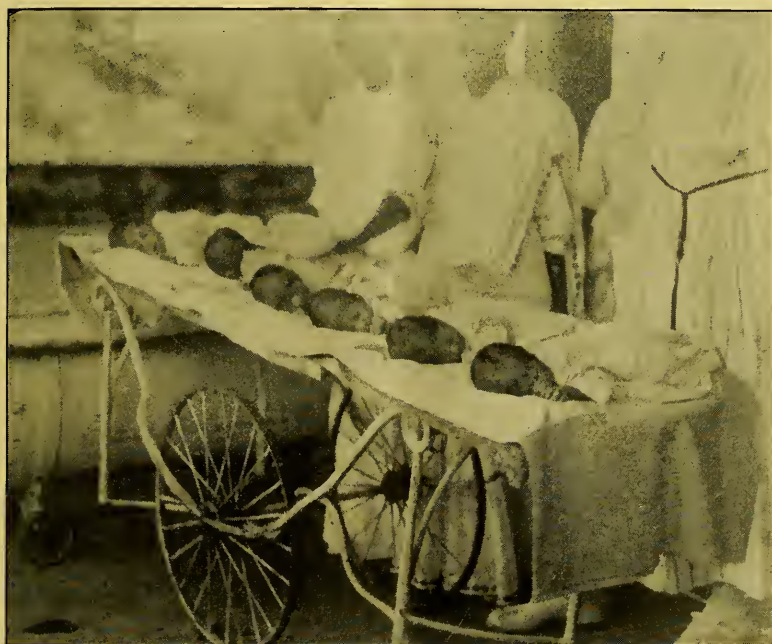
Latest Arrivals at Vellore Hospital

The Collegiate Alumnæ all over the country are taking up the cause with great earnestness. "College Days" are being held in many towns, luncheons and drawing room teas are projected, the material is ready for use,—a pageant, a stereopticon lecture, pledges for "Bright Hours," leaflets with up-to-date information. State Committees are being formed and many women are praying and working for this desired end. Most of the Woman's Boards are co-operating. Our own Board, as has